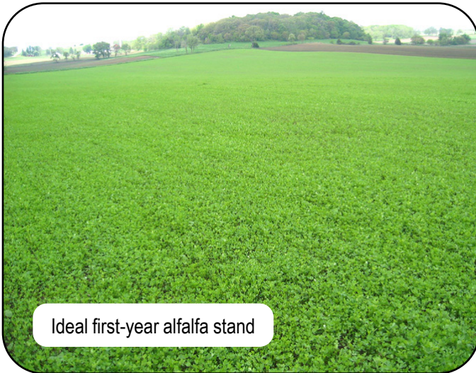
Ideal first-year alfalfa stand